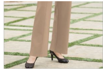
Slimtacular® Ponte Knit Straight Leg Pull-on Pants $48.99 - $75.99