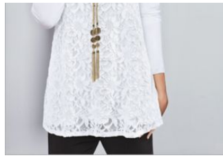
Together Lace Overlay Knit Tunic Was $69.99 - $75.99 Now $23.97 - $25.97