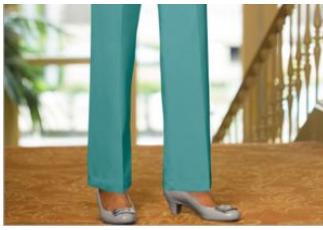
Couture Crepe™ Pull-on Pants $46.99 - $79.99